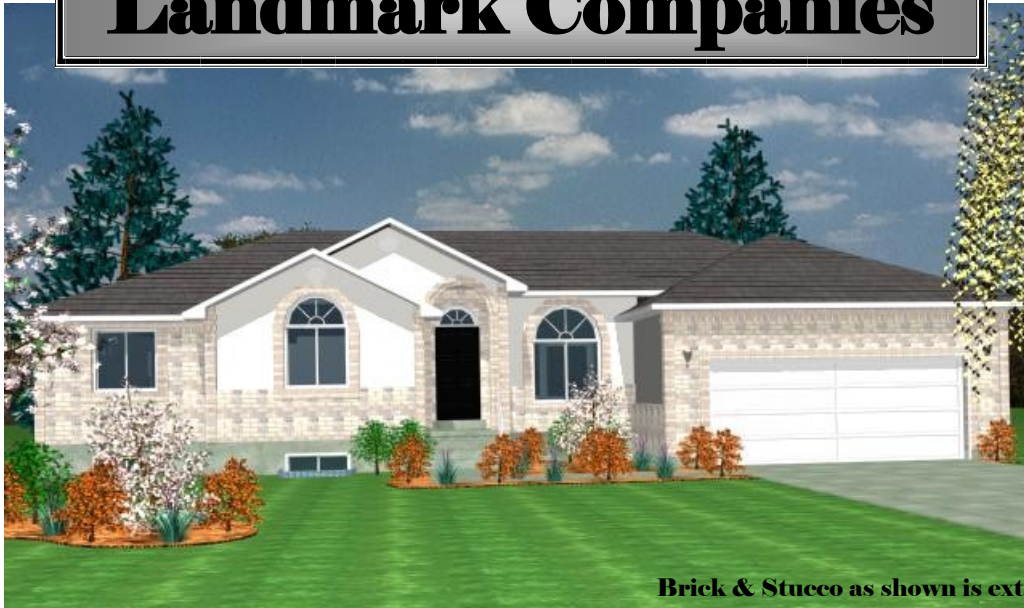
Brick & Stucco as shown is extra